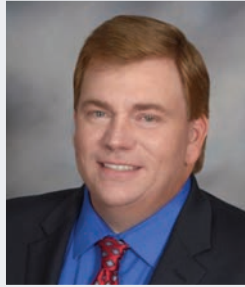
Hon. Lamont McClure County Executive Northampton County