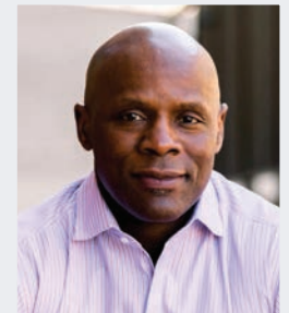
Drew R. Lewis Business Executive and Entrepreneur