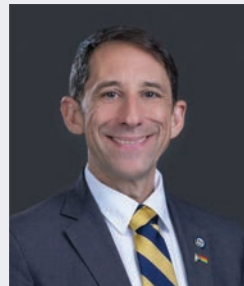
Hon. Matt Tuerk Mayor City of Allentown