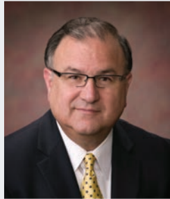
Hon. Sal Panto Jr. Mayor City of Easton