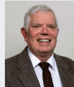
Hon. Dan Hartzell Commissioner-at-Large Lehigh County Board of Commissioners