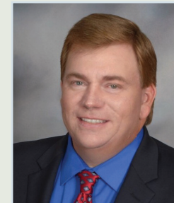
Hon. Lamont McClure County Executive Northampton County