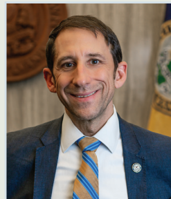
Hon. Matt Tuerk Mayor City of Allentown