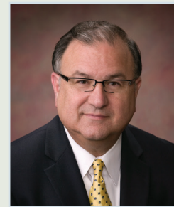
Hon. Sal Panto Jr. Mayor City of Easton