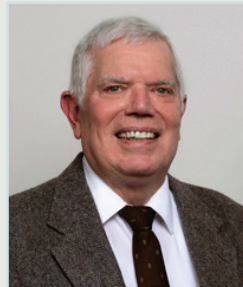
Hon. Dan Hartzell Commissioner-at-Large Lehigh County Board of Commissioners